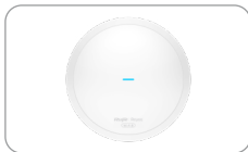
Part Code: RG-RAP62 Reyee Wi-Fi 6 1.774 Gbps AX1800 Indoor Ceiling Access Point