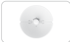
Part Code: RG-AIRMETRO460F Reyee RG-AirMetro460F Wireless Bridge CPE 5 GHz 867 Mbps 1x 10/100 Mbps Port