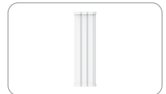
Part Code: RG-ANT16S-120 Reyee RG-ANT16S-120 Sector External Antenna 5 GHz 5 km