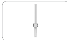
Part Code: RG-ANT13-360 Reyee RG-ANT13-360 Omnidirectional External Antenna 5 GHz 2 km