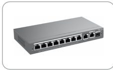
Part Code: RG-ES210GS-P Reyee 10 Port Gigabit Smart Cloud Managed Switch 1x SFP 8x PoE+ 120 W