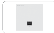
Part Code: RG-RAP1261 Reyee Wi-Fi 6 2.976 Gbps AX3000 Ultra-Thin Wall Plate Access Point