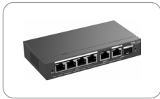
Part Code: RG-ES206GS-P Reyee 6 Port Gigabit Smart Cloud Managed Switch 1x SFP Combo 4x PoE+ 54 W