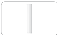
Part Code: RG-ANT20S-90 Reyee RG-ANT20S-90 Sector External Antenna 5 GHz 10 km