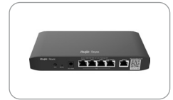
Part Code: RG-EG105G-V3 Reyee 5 Port Cloud Managed Router V3