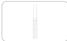
Part Code: RG-RAP52-OD Reyee Wi-Fi 5 1.267 Gbps AC1300 Dual-Band Outdoor Access Point