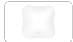
Part Code: RG-RAP72PRO Reyee Wi-Fi 7 5.011 Gbps BE5040 Dual-Band Ceiling Access Point