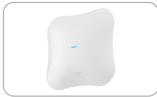
Part Code: RG-RAP73PRO Reyee Wi-Fi 7 13.346 Gbps Tri Radio BE14000 Ceiling Access Point