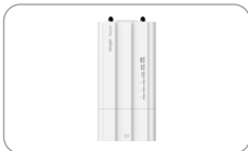
Part Code: RG-AIRMETRO550G-B Reyee RG-AirMetro550G-B Wireless Bridge Base Station 5 GHz 867 Mbps 2x 10/100/1000M Mbps Ports