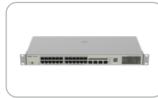
Part Code: RG-NBS3100-24GT4SFP-P-V2 Reyee 28 Port Gigabit Layer 2 Cloud Managed Switch 4x SFP 24x PoE+ 370 W