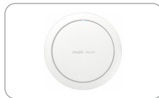
Part Code: RG-RAP2266 Reyee Wi-Fi 6 2.976 Gbps AX3000 Indoor Ceiling-Mount Access Point