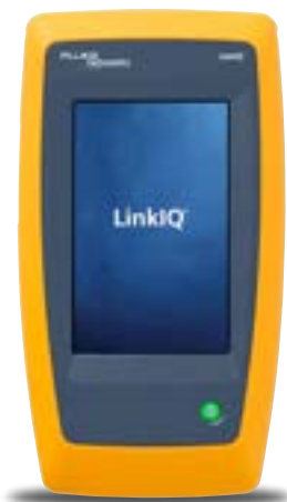
Fluke Networks LinkIQ™ Cable+Network Tester