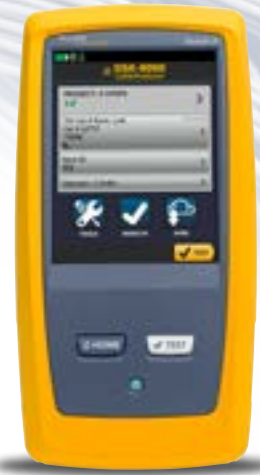
Fluke Networks DSX2-8000

where multiple teams are involved in the testing process, with varying media types and multiple testing requirements. The DSX is part of our Versiv™ modular design platform that supports copper certification, fiber optic loss, OTDR testing and fiber end-face inspection in one.