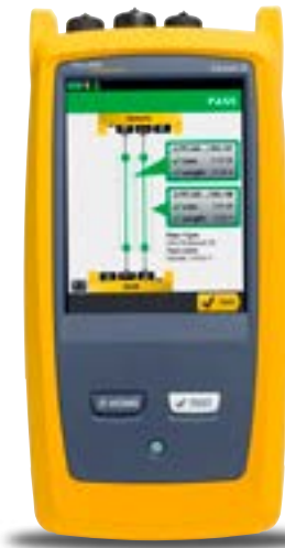
Fluke Networks CertiFiber® Pro