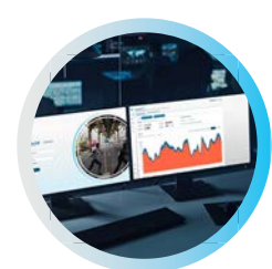
PELCO CALIPSA Make your existing cameras smarter

In order to improve the safety of patients and staff from critical situations, healthcare facilities are able to elevate their existing security system with Calipsa Basic+. It enables real-time video analytics for hospitals to quickly identify threats to patients, staff, visitors and property. Basic+ removes unwanted false alarms, improving your efficiency of preventing crimes from happening.