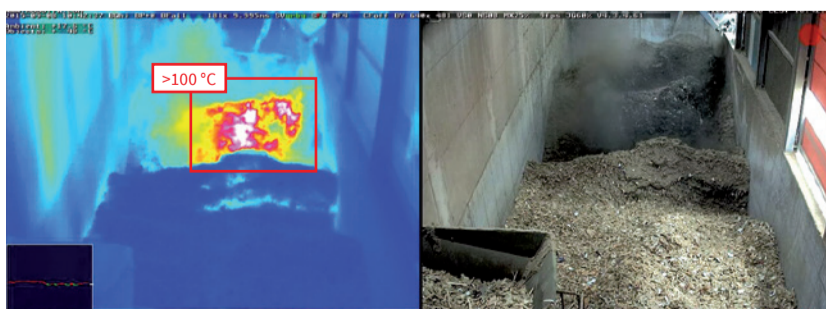
Thermal Radiometry (TR)